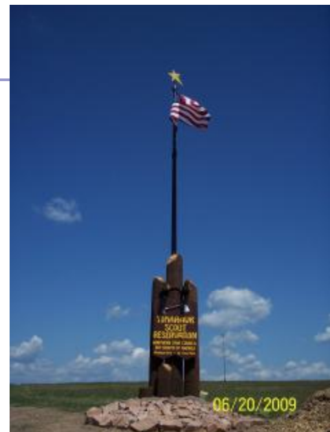
New entrance sign completed on June 20, 2009 Thank you to all who contributed to this project.